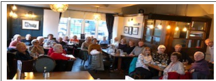
THE CHAIR BASED EXERCISE CLASS ENJOYING LUNCH AT THE LORD DARCY

Readers and Readings for December will be announced in your Weekly News-sheets